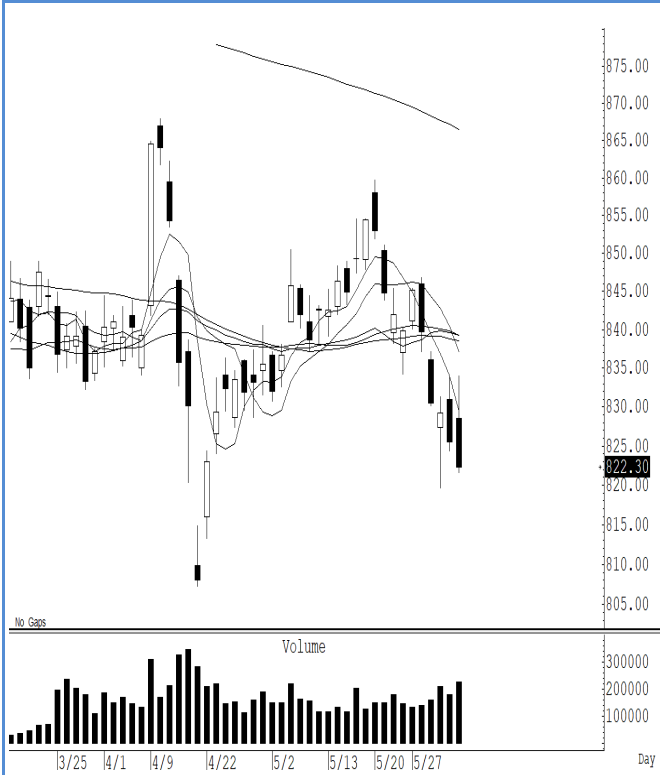
S50M24 (Close 822.30 Chg -3.20)